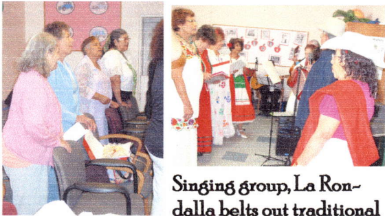
Participants proudly sing along!